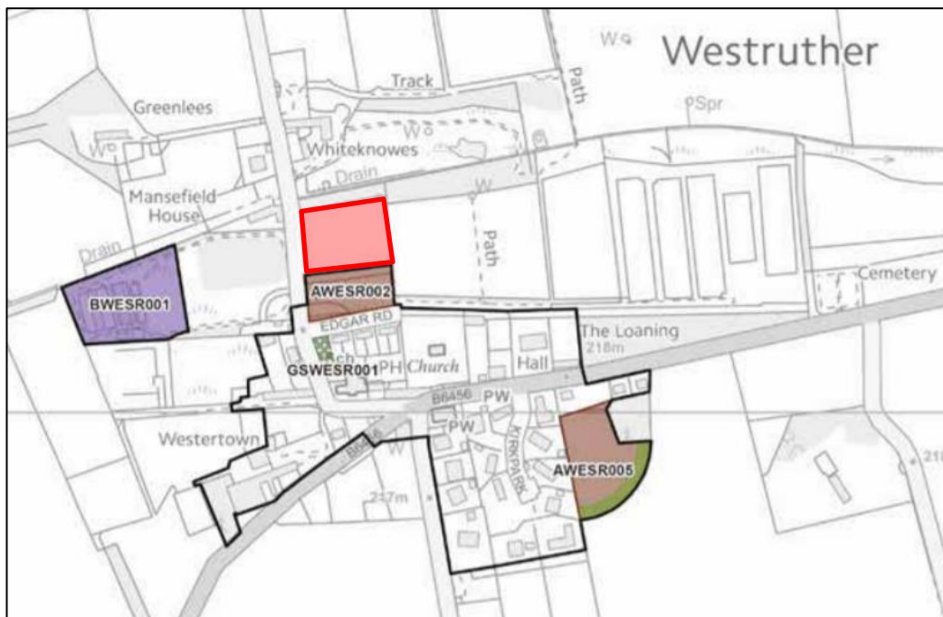
Figure 3 – LDP2 Proposed Plan extract with proposed housing site edged in red

[REDACTED] and its location relative to Site Refs. AWESR002 and AWESR005 is indicated on Figure 3 below.