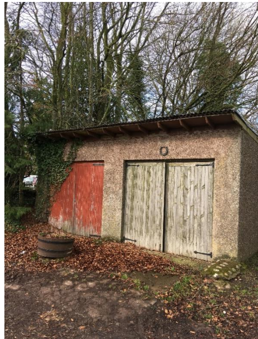
Figure 2 – Redundant outbuildings on site