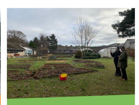
Greener Peebles Community Garden