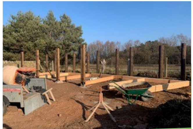
Composting bays at Cockburnspath in construction