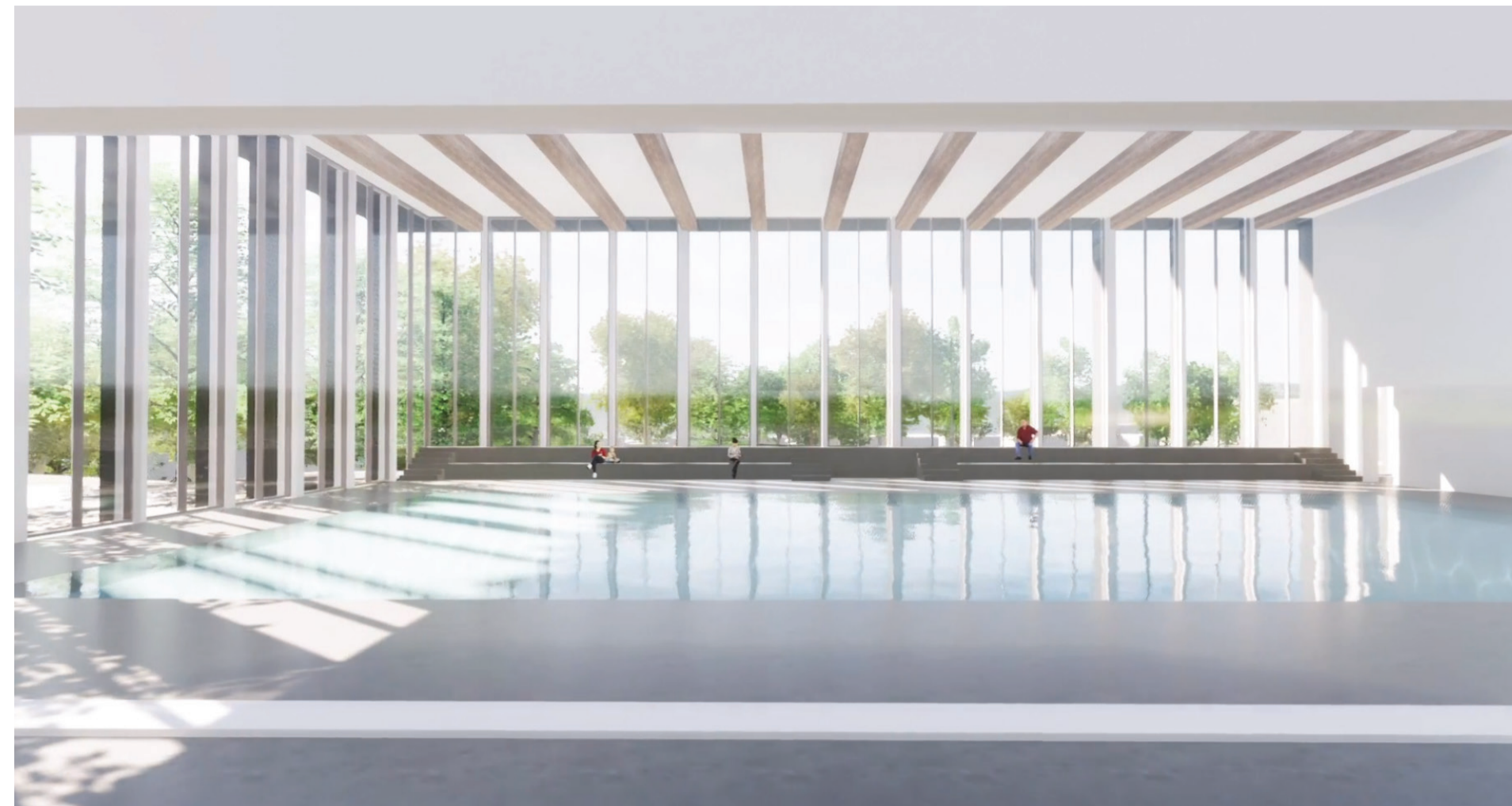
Vibrant community facilities