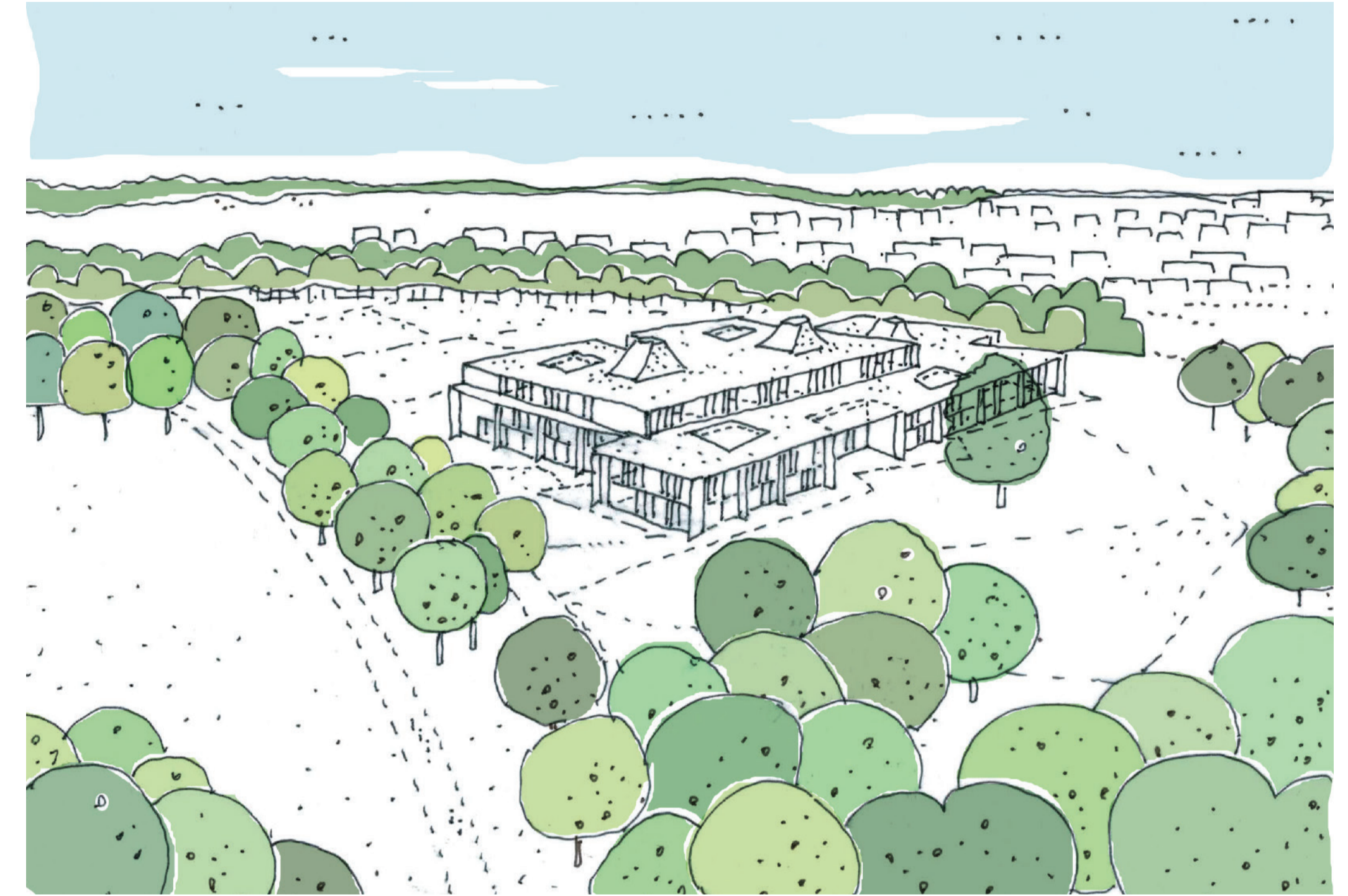
Aerial view from South East