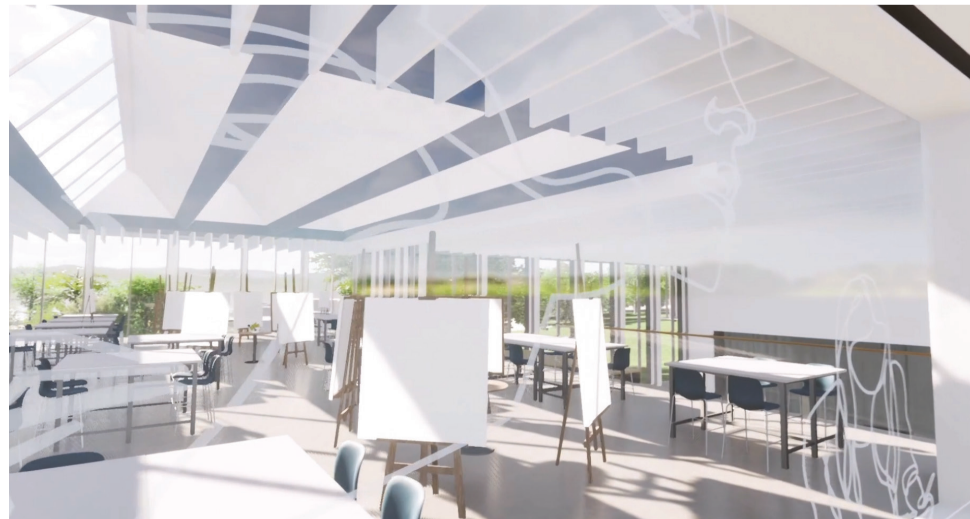
Inspiring teaching spaces