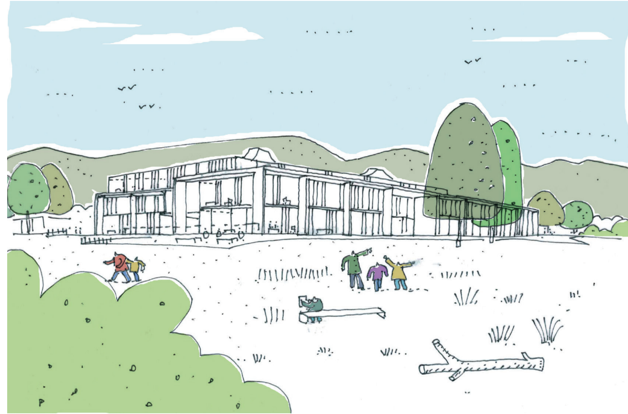
View across Scott Park