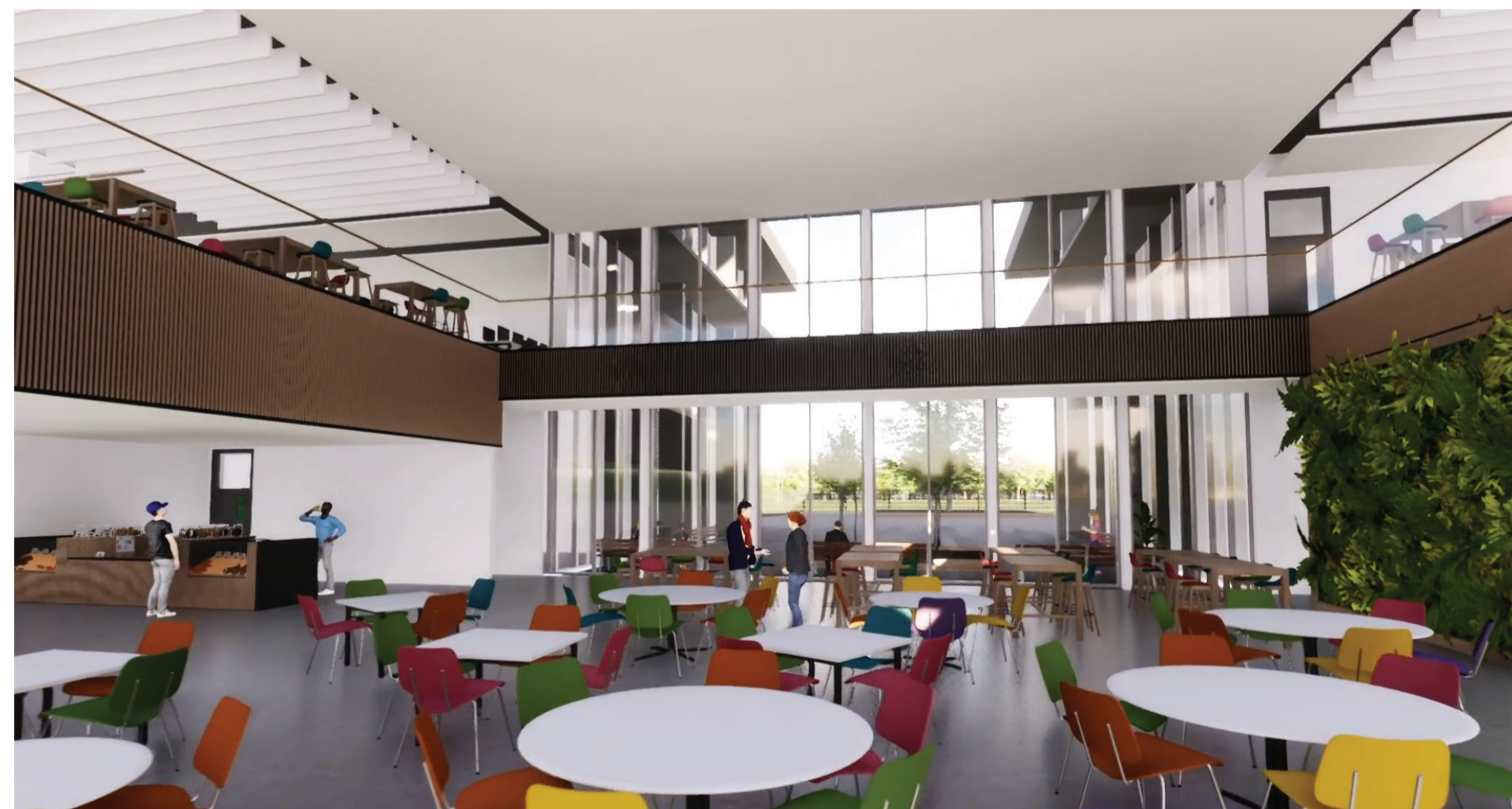
Places to learn and socialise together