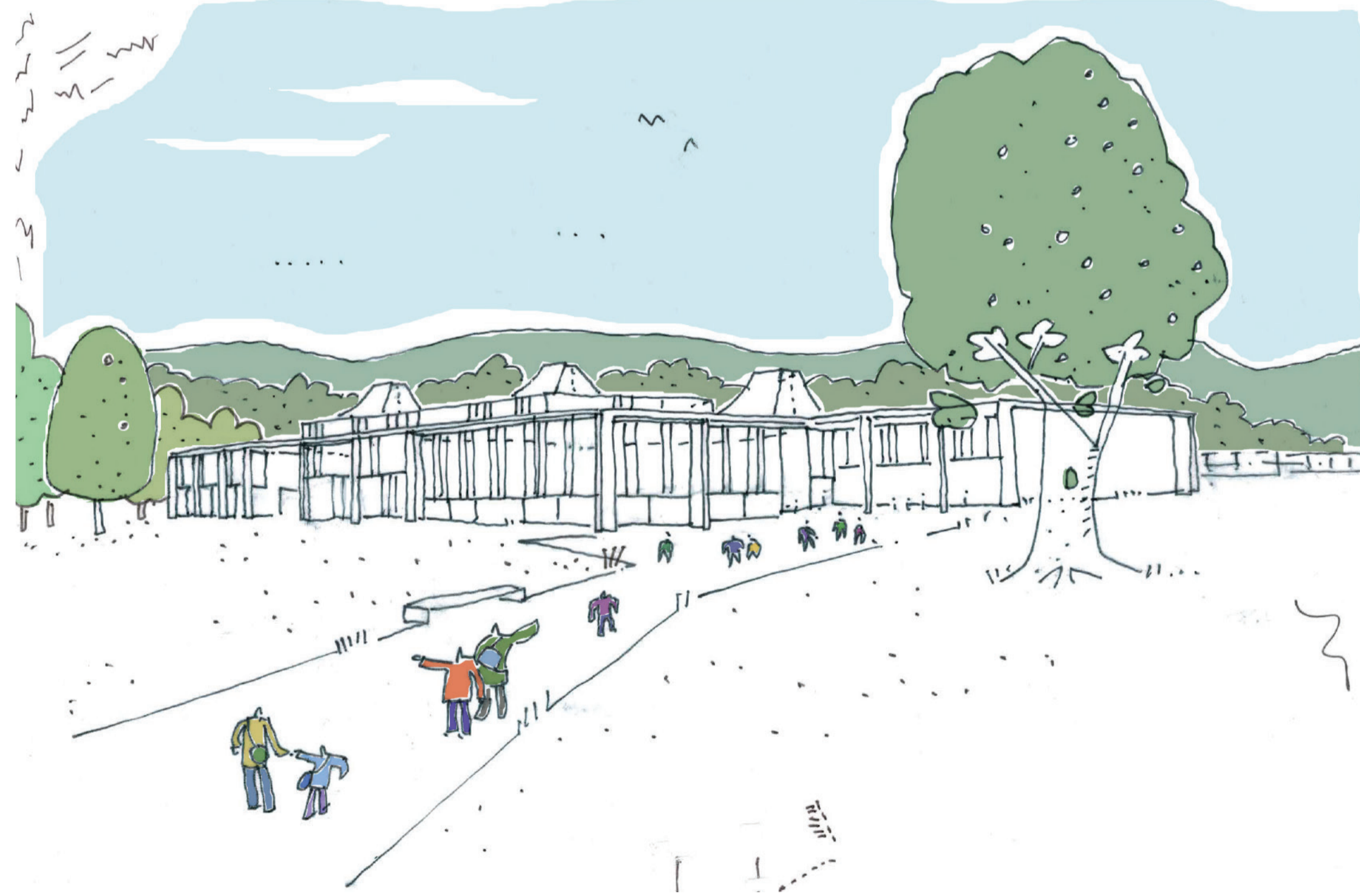
Approach from Livingstone Place