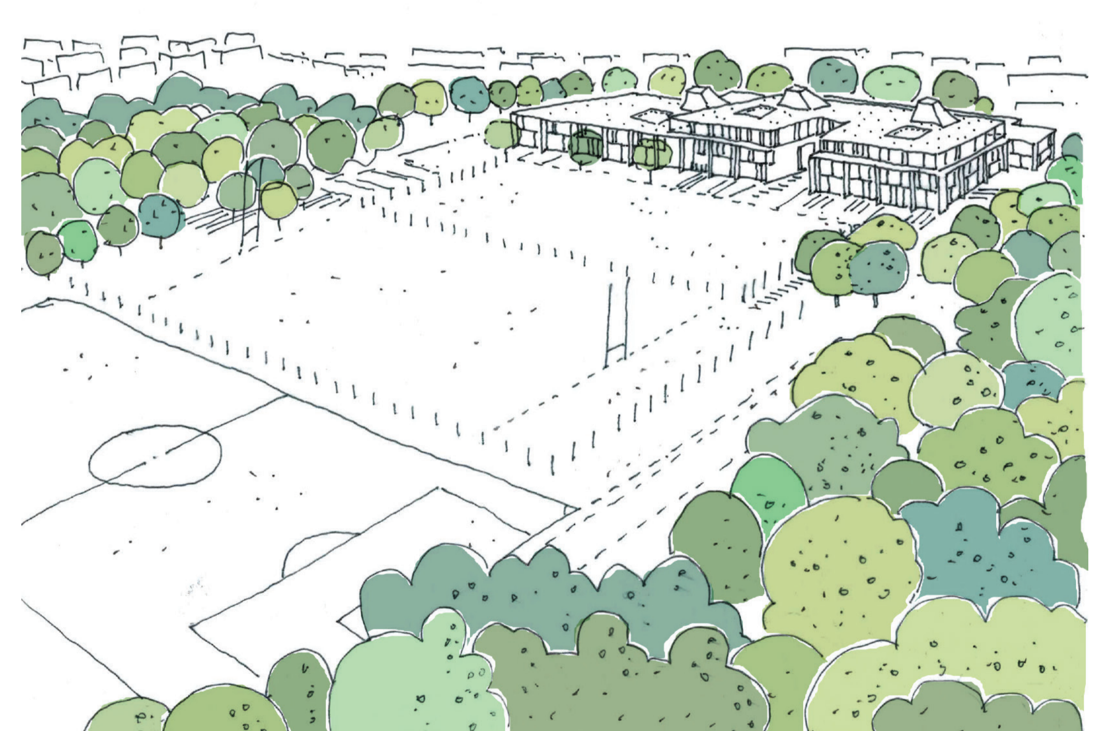
Aerial view from South West