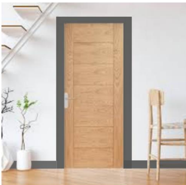
Apartment Doors with skirting and arcitraves used to highlight doorway.