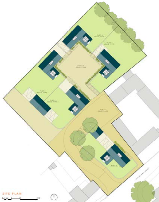
Figure 5-Site layout and elevations of approved development to the east.