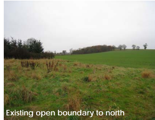
Figure 4—Views from within site.

The northern boundary of the site, which follows the settlement boundary of Eccles in the Local Plan, bounds an arable field. The southern boundaries of the site bound the gardens of the existing properties to the south where a variety of boundary treatments exist, including walls, fences and hedges.