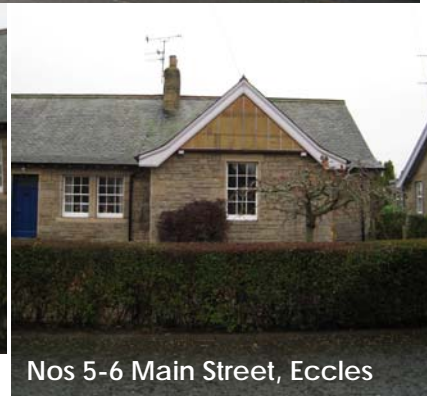
Figure 3—Main Street, Eccles.