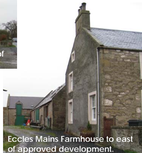
Eccles Mains Farmhouse to east of approved development.