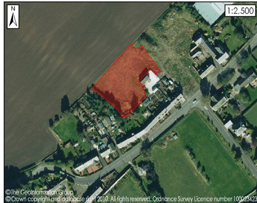
Figure 2-Aerial Image of Local Context