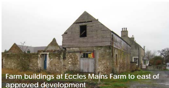
Farm buildings at Eccles Mains Farm to east of approved development