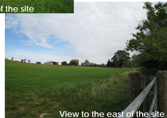
View to the east of the site