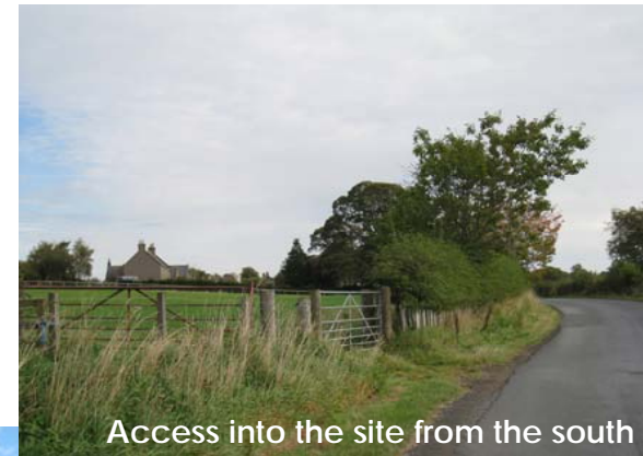
Access into the site from the south

The site is allocated for Housing within the Finalised Local Plan Amendment and has a site area of 1.5ha with an indicative capacity of 15 units. The existing site boundaries consist of post and wire fencing and hedgerows. The Plan sets out a requirement for new Structure Planting/Landscaping along the northern and western boundaries of the site.