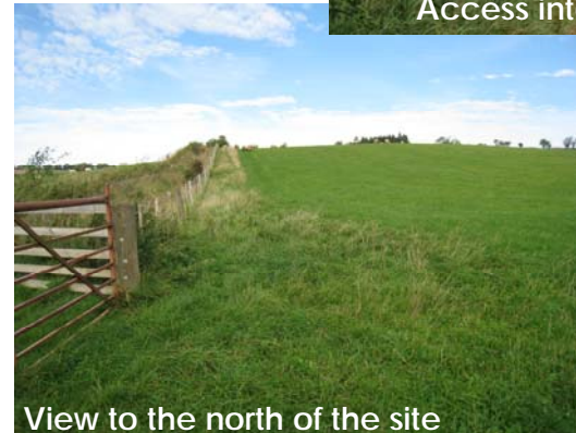
View to the north of the site