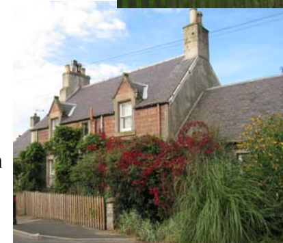
Figure 6 - Existing properties within Lilliesleaf