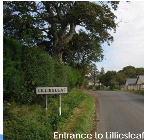
Entrance to Lilliesleaf