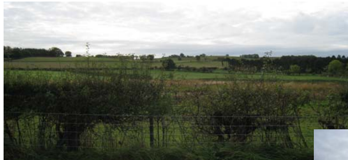
Figure 3 - Views from the site to the south