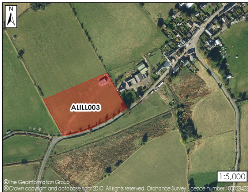
Figure 1 - Aerial image of the site

A number of policies included in the Finalised Local Plan Amendment will be applicable to this site including 'Principle 1-Sustainability', 'G1-Quality Standards for New Development', 'G7-Infill Development', 'H1-Affordable Housing' and 'H3-Land Use Allocations'. Furthermore, key Supplementary Planning Guidance include 'Placemaking and Design', 'Renewable Energy' and Landscape and Development'.