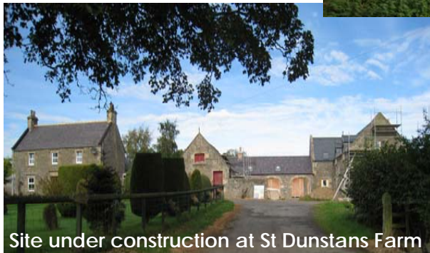
Site under construction at St Dunstans Farm