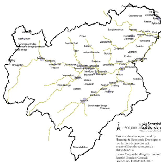
Figure 2: Settlements of Scottish Borders

Figure 2 shows the main settlements in the Borders, along with the network of roads that link them. The dispersed nature of settlements in the Scottish Borders is clearly evident, as is their relatively small size.