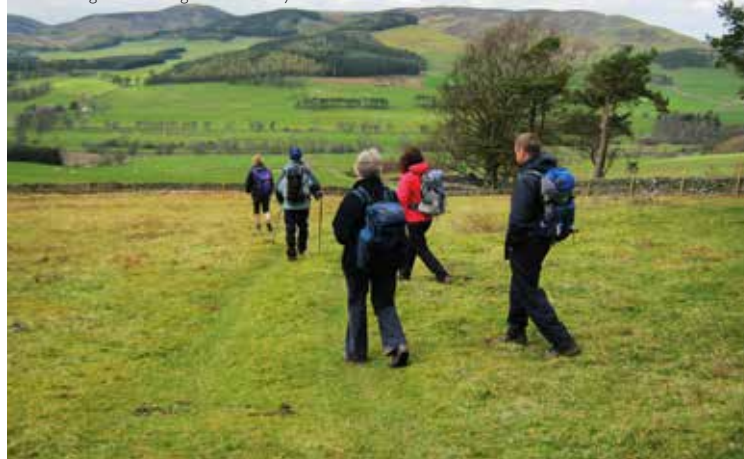
Heading down through Easter Dawyck