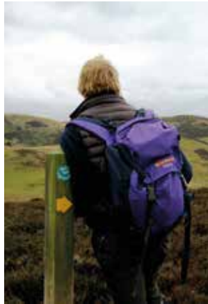
Walker below Penvalla