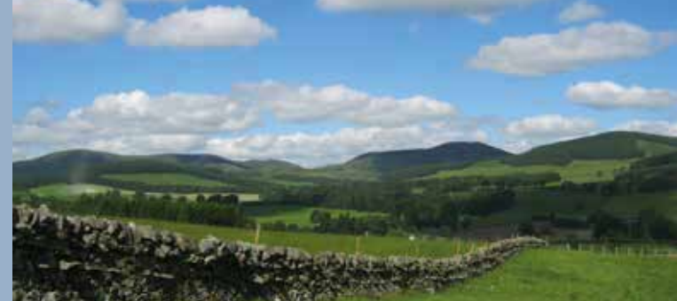
Looking to Broughton Heights