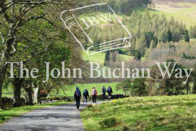
On the road below Cademuir Hill

Yon are the hills that my hert kens weel, Hame for the weary, rest for the auld, Braid and high as the April sky, Blue on the taps and green i' the fauld: At ilka turn a bit wanderin' burn, And a canty biggin' on ilka lea There's nocht sae braw in the wide world's schaw As the heughis and holms o' the South Countrie.