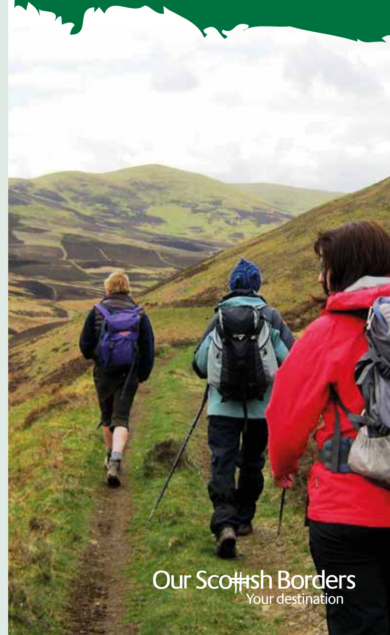
Front Cover Photo - Hammer Head, Stobhope Head