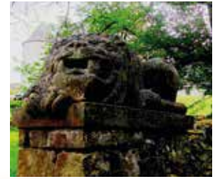
Lion gate post at Broughton Place

Peebles is today a busy and lively town with interesting shops in the High Street and a wide range of accommodation, restaurants, cafes and other services for the visitor. The surrounding countryside offers unlimited opportunities for walking, cycling and horse riding.