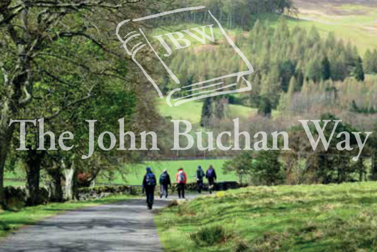
On the road below Cademuir Hill

Yon are the hills that my hert kens weel, Hame for the weary, rest for the auld, Braid and high as the April sky, Blue on the taps and green i' the fauld: At ilka turn a bit wanderin' burn, And a canty biggin' on ilka lea There's nocht sae braw in the wide world's schaw As the heughis and holms o' the South Countrie.