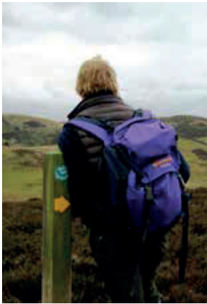
Walker below Penvalla