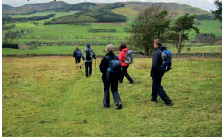
Heading down through Easter Dawyck