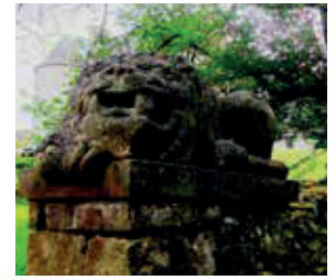
Lion gate post at Broughton Place

Peebles is today a busy and lively town with interesting shops in the High Street and a wide range of accommodation, restaurants, cafes and other services for the visitor. The surrounding countryside offers unlimited opportunities for walking, cycling and horse riding.