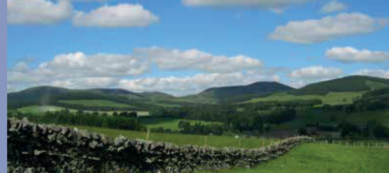
Looking to Broughton Heights