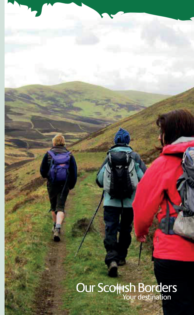
Front Cover Photo - Hammer Head, Stobhope Head