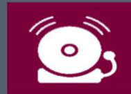
Alerts about scams and frauds