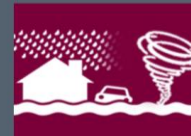
Severe weather warnings