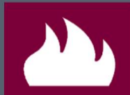
Information about emergencies