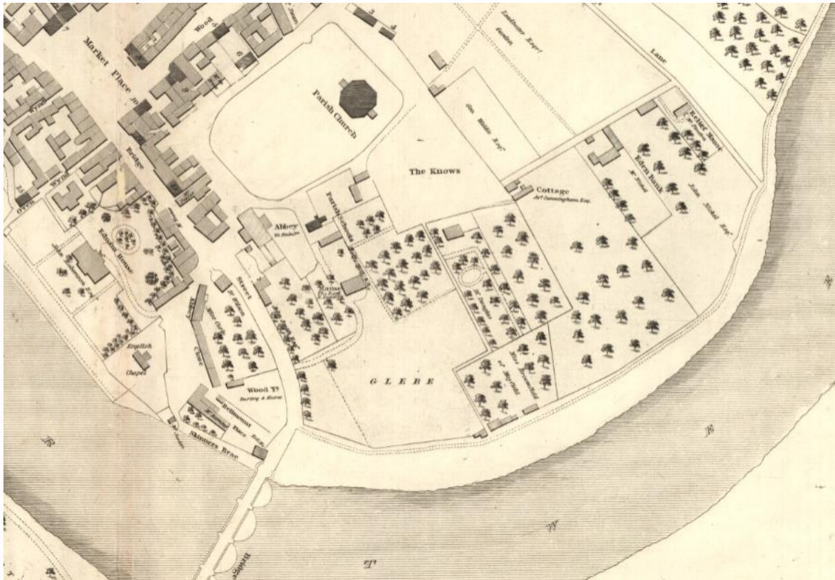
Map of Mayfield area of Kelso from 1823- Showing the two small green site(s) adjacent to the entrance to Klondyke Garden Centre, as Orchards.