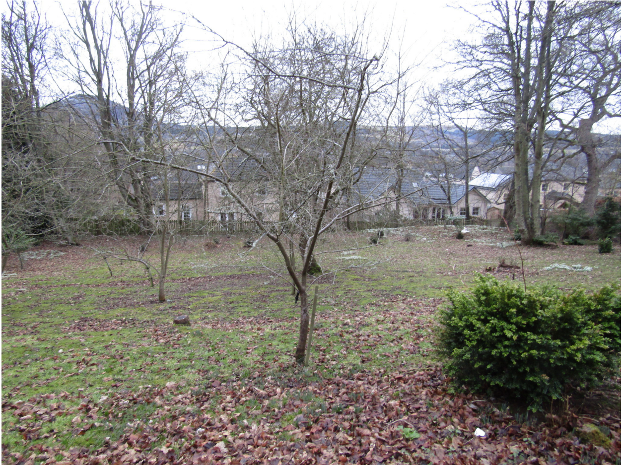
Looking south from the proposed site towards the Eildons