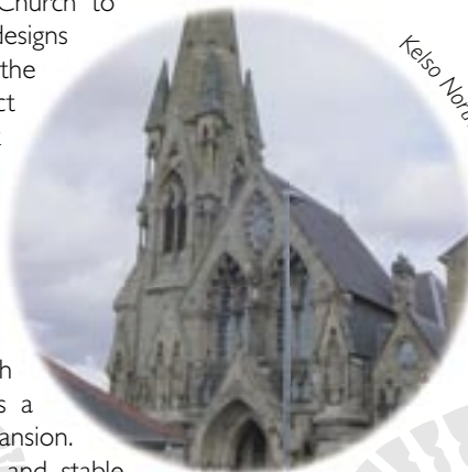
Kelso North Church