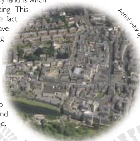
Aerial view of Kelso

From The Square, turn left into Bridge Street and enter the area of the former precinct of Kelso Abbey.