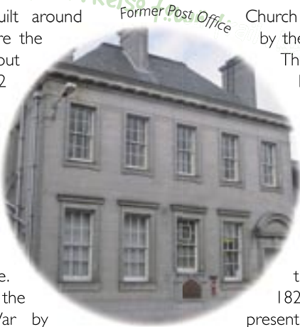
Former Post Office

Once more you arrive in The Square. Turn sharp right and leave The Square via Bowmont Street. This lane is known locally as "The Dardanelles". In front of you is a public bar and to your right, on the corner with East Bowmont Street, is the former Trinity North