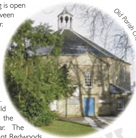
Old Parish Church

There are some fine examples of trees within the churchyard including Sycamore, Lime and Giant Redwood. Pairs of Rooks build their nests high in the treetops every year. The soft bark of the Giant Redwoods provides shelter for small birds such as the Treecreeper, which pecks out small hollows in the bark to give itself extra shelter. At night Tawny Owls may be heard here.