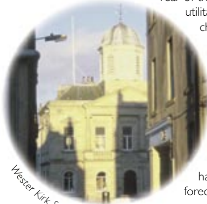
West Kirk Stile

On the edge of the kirkyard Abbey Row is separated from the bustle of Woodmarket and the town by a block of buildings. Pedestrian links through to the town centre are via the East and West Kirk Stiles. The rear of the buildings vary from utilitarian to grand in character.