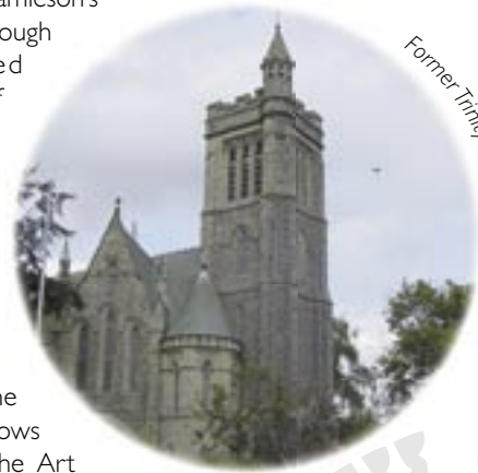
Former Trinity North Church

Looking over the car park on your left, you will see the Red Lion in Jamieson's Entry. Although mentioned in a list of traders of 1826, the present building dates from 1905. The building has traditional details such as crowstep gables and corner turret and the ground floor windows are interesting as the Art Nouveau movement has clearly influenced them.