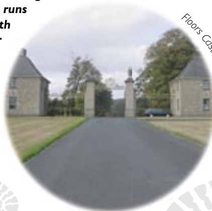
Floors Castle Gates

Walk along Roxburgh Street, which runs parallel with the River Tweed.