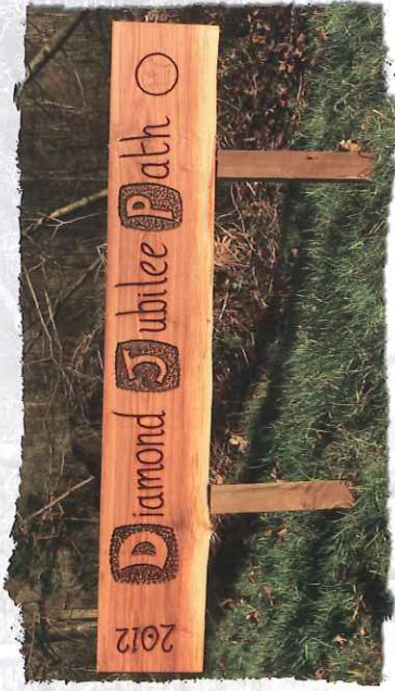
Crafted by Ozzy Mackinnon

The historic Cowdenknowes House and Redpath Village provide added interest along the way.