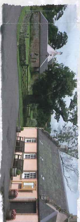
Redpath Village Detour.

You can walk into Redpath Village by turning left up the lane and following the obvious path to the right across the field. You emerge at the side of the village hall at the west end of the Main Street.