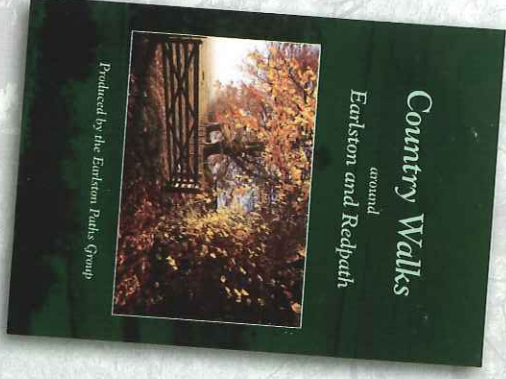
Produced by the Earlston Paths Group