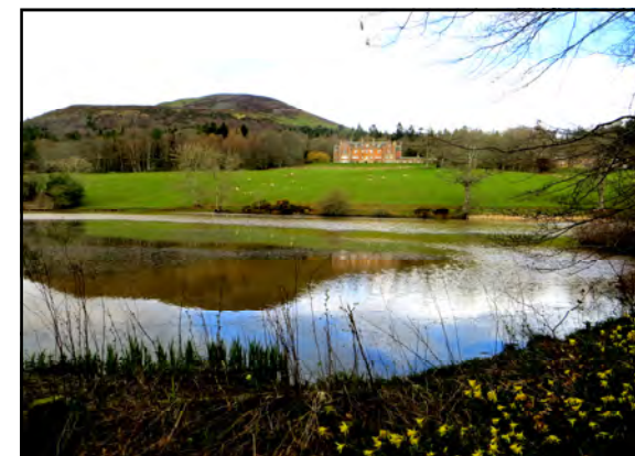
Eildon Hall Loch View

Follow track go over the Eildon Hall tarmac Drive. Follow path signs /way-marker posts back to Newtown. (For Eildon Hall Loch View follow sign to the right). At rugby pitch, Primary School go past corrugated iron building, until reaching main road where you turn right back to the village centre.