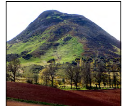
North Eildon Hill - 1,325 ft

Go past Council Offices and take first left into Sprouston Rd. Follow sign to Eildon Hills/Bowden at Primary School. In middle of field, turn right at signpost to Eildon Hills.. Cross Eildon/Greenwells Road and Eildon Hall Drive and follow way-marker posts to gate at top. Through gate and follow path up North Hill and contour across the bronze age plateau to the top. (A shorter route for the really fit is to go straight up, see diagram.) Coming back down follow St Cuthbert's Way from between Mid and North Hill. At bottom turn left when path goes to the right and follow track towards Eildon Hall. Follow track to the right of the Hall down the hill and turn left at sign 'Eildon Hall loch view'. Follow path past the loch and through the woods which then joins the out ward path. Turn right and return using outward route to village cen-