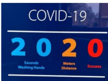
Signage to promote hygiene and social distancing measures