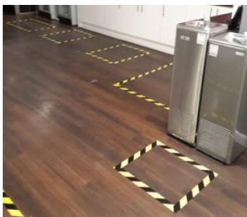
Distancing markers in a kitchen