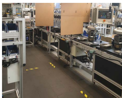
Temporary board dividers