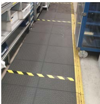
2m floor markings