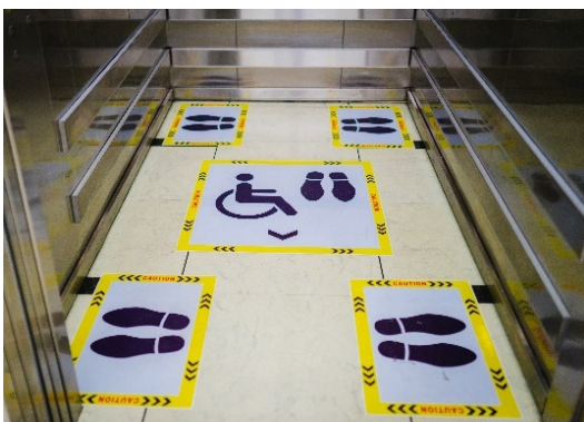
Example lift practices