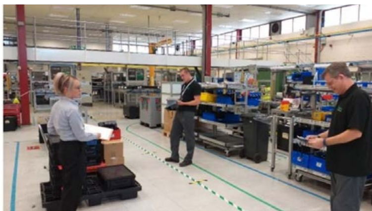
Shift briefing with social distancing