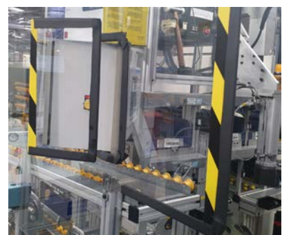
Perspex dividers with edge marking