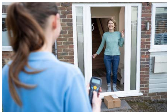
Contact free delivery