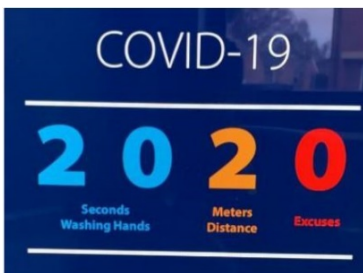
Signage to promote hygiene and social distancing measures