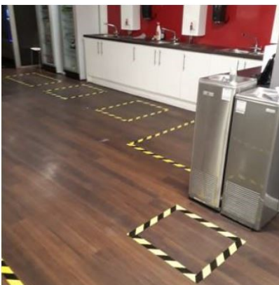
Revised staff kitchen layout